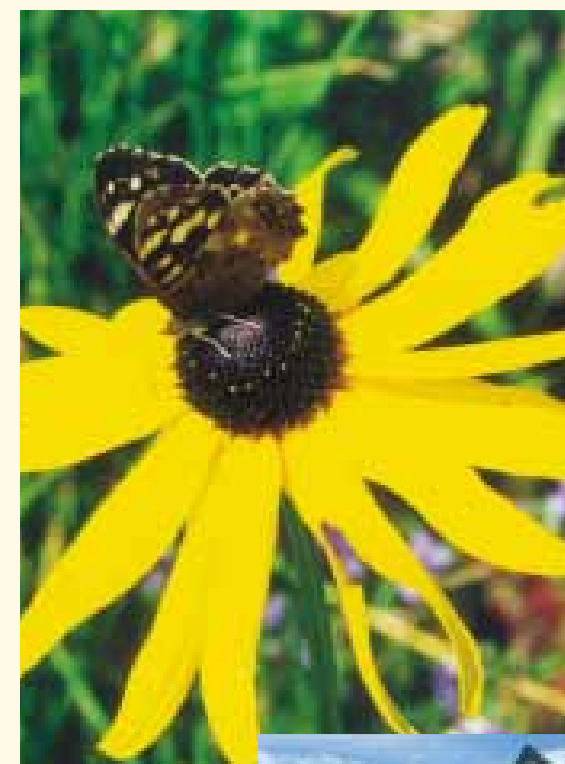
Speckled Wood butterfly basking.